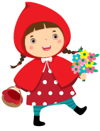
Little Red Riding Hood

Look at the pictures of the story's characters. Read the story and circle the correct pictures.