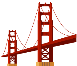
Golden Gate Bridge, California