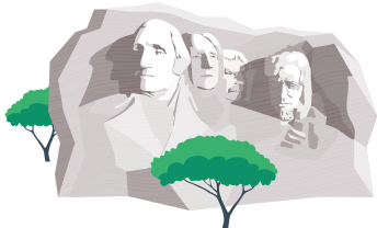
Mount Rushmore, South Dakota