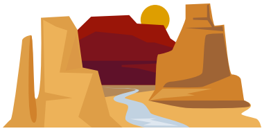
Grand Canyon, Arizona

Help the visitor centers record how many people visited these national landmarks by rounding up to the nearest hundred . Check the correct answer.