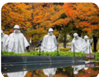
Franklin Delano Roosevelt Memorial