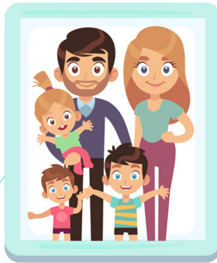
Family of 5

Draw a line to the family that has one less person.