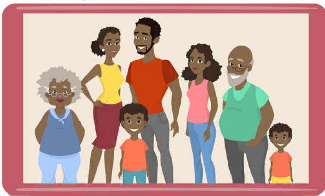
Family of 7