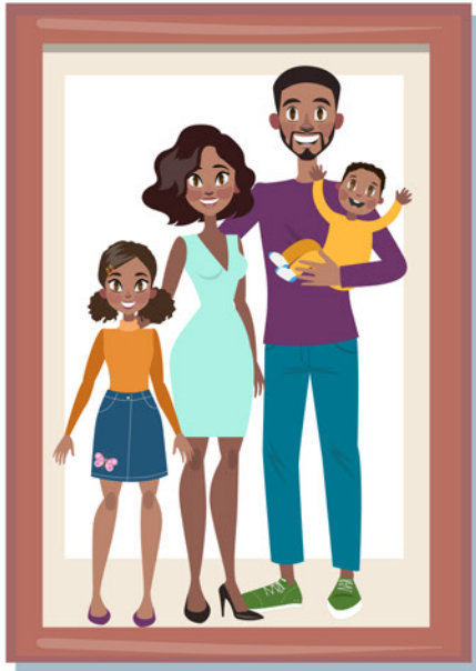
Family of 4