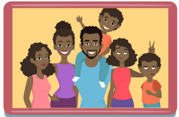
Family of 6