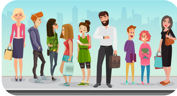
lots of people