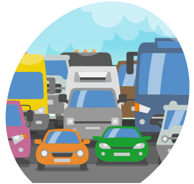
loud and busy streets