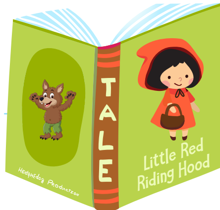
“Little Red Riding Hood”

Draw a line from the poem or story book to the correct column.