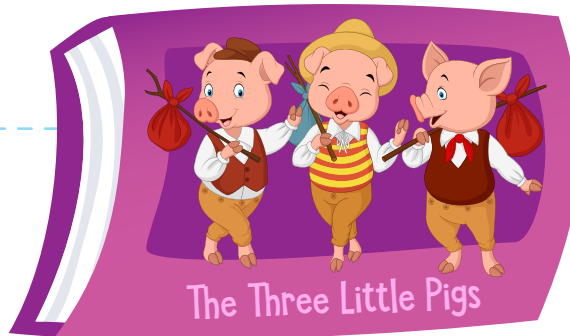
“The Three Little Pigs”