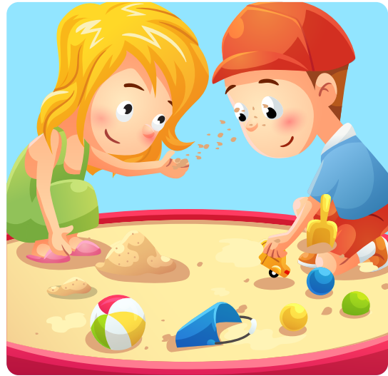
Sand in the eyes