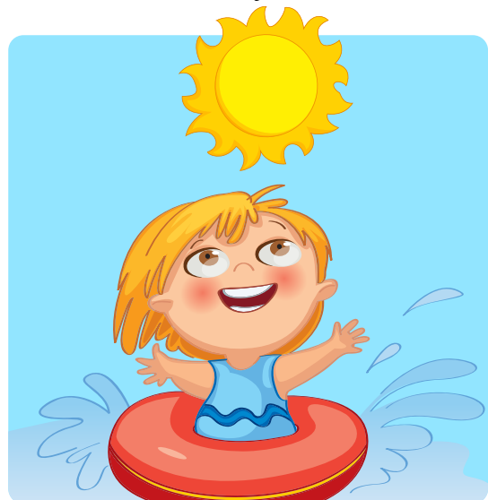
looking at the Sun